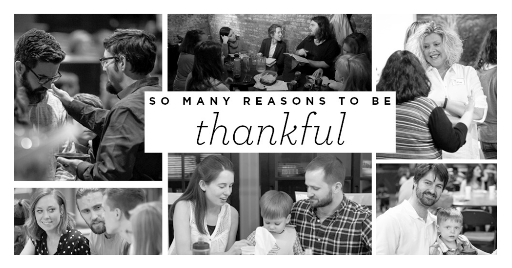
Great are the works of the LORD; they are pondered by all who delight in them. Psalm 111:2

Psalm 111 invites us to reflect on what God has done so that we will more deeply delight in him. As the year ends, how have we seen God at work in Redeemer in 2019?