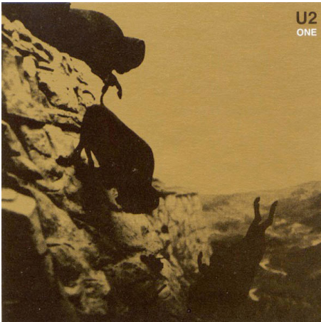
U2, “One,” 1992

19 The word of the LORD came to Jeremiah: 20 “This is what the LORD says: ‘If you can break my covenant with the day and my covenant with the night, so that day and night no longer come at their appointed time, 21 then my covenant with David my servant—and my covenant with the Levites who are priests ministering before me—can be broken and David will no longer have a descendant to reign on his throne.’”